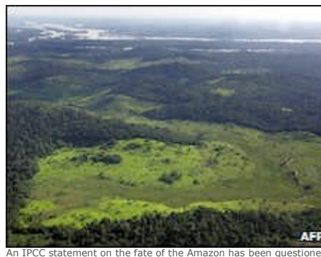
An IPCC statement on the fate of the Amazon has been questioned

A blunder perhaps, but maybe of a different kind, because there is indeed plenty of published science warning about drought in the Amazon.